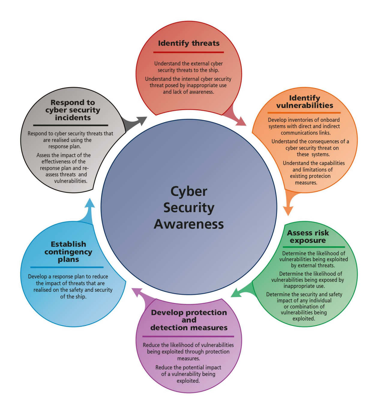
Figure 1. Cyber security awareness as set out in the Guidelines

In the event of a cyber incident, a response plan is needed to quickly recover systems and data and to maintain the safety and commercial operability of the ship. Some mitigating measures are already covered by the ship's safety management system for complete systems failure, but more sophisticated cyber incidents may only cause partial malfunction of a system, making it harder to detect.